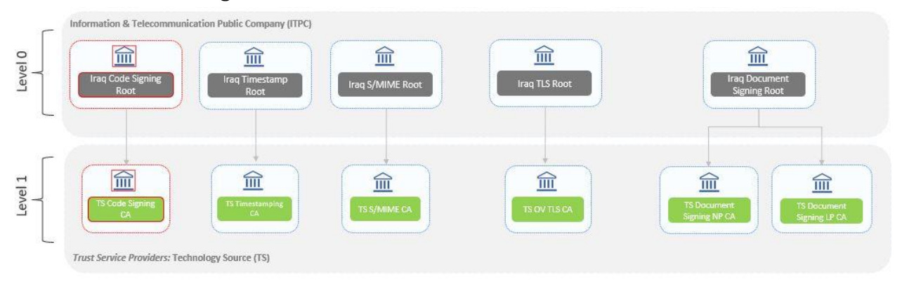
Figure 1 Iraq National PKI hierarchy

Level 1: The TS's Subordinate CAs falls at this level within the National PKI hierarchy as shown in the below figure :